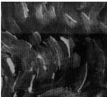
Figure 1. Magnified X-ray image of part of the top right section of the F614 painting, showing not only the detail of the brushstrokes on the painting but also the canvas underneath (fine horizontal and vertical lines visible when looking closer at the painting).

But when this ground layer presses on the threads of the canvas, it fills the space between the threads, so it becomes thicker in the spaces between threads and thinner where the threads overlap. “The way this ground layer presses on the threads is similar to pressing mud against a metal grid,” Corbeil says. “When you remove the grid, all you see is the imprint of the grid on the mud. In the case of the painting, when you look at the