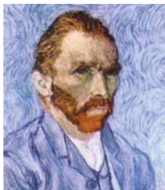
Self-portrait of artist Vincent van Gogh