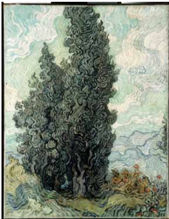
The painting known as F 614

X-rays are a form of electromagnetic radiation that is invisible to our eyes. Targeting X-rays onto a painting is similar to the technique doctors use to look inside our bodies and spot broken bones. An X-ray film captures the radiation passing through the body, creating darker areas where the X-rays go through and lighter areas where most of the X-rays are absorbed.