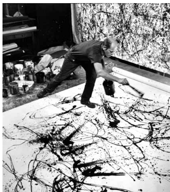
Jackson Pollock painting Autumn Rhythm: Number 30 , 1950.

The radiation used in the FTIR technique is infrared light—the type of light emitted by heat lamps that warm food. When molecules absorb infrared light, they vibrate at frequencies that depend on their chemical structure and composition. By looking at how infrared light is absorbed by a sample, scientists can determine the nature of the sample.