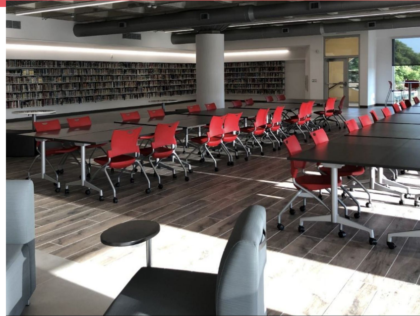
EXAMPLE: SANTA ANA HIGH SCHOOL LIBRARY