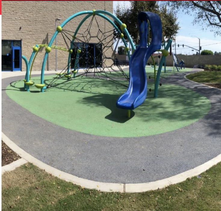
ROMERO CRUZ ACADEMY: NEW KINDERGARTEN