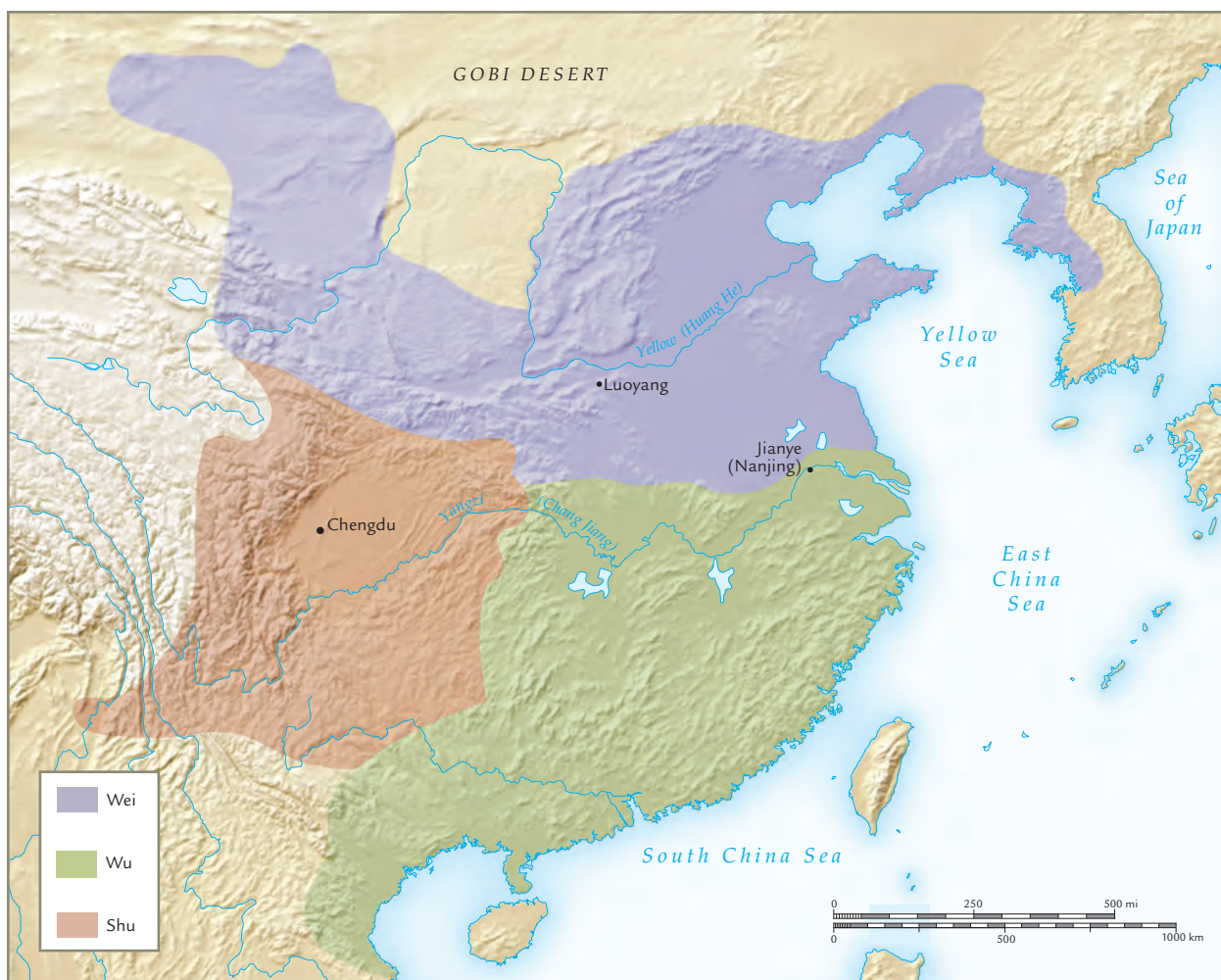
Map 12.3 China after the Han dynasty, 220 C.E. Compare this map with Map 8.2 showing the Han empire at its height. What geographical considerations might help explain why the Han empire broke up into the three kingdoms shown here?