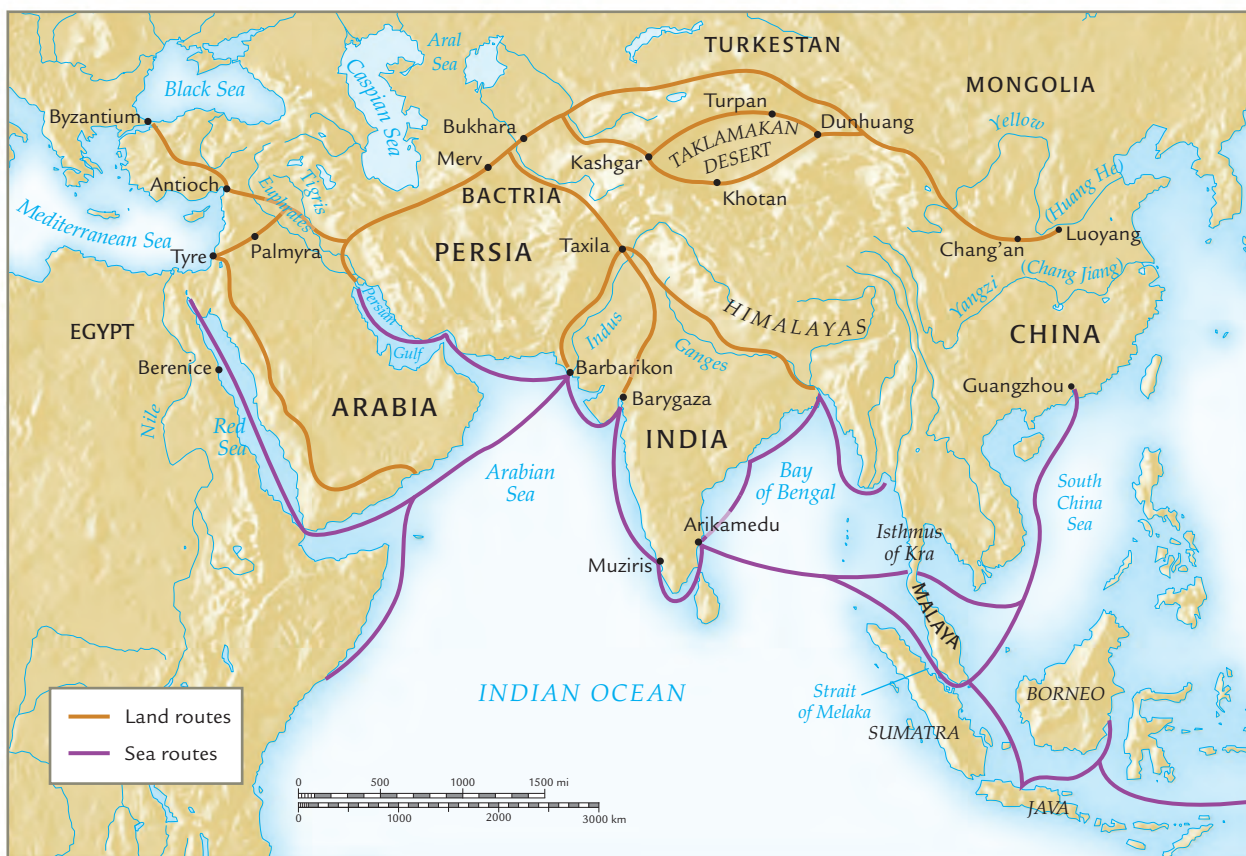
Map 12.1 The silk roads,

200 B.C.E.–300 C.E. Note the extent of the land and sea routes known collectively as the silk roads. Consider the political and economic conditions that would be necessary for regular travel and trade across the silk roads.