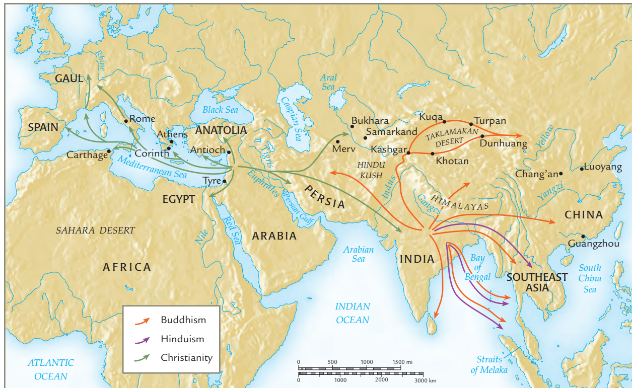
Map 12.2 The spread of Buddhism, Hinduism, and Christianity, 200 B.C.E.–

400 C.E. Compare the routes taken by Buddhism, Hinduism, and Christianity with the routes followed by merchants on silk roads depicted on Map 12.1. How might you account for the similarities?