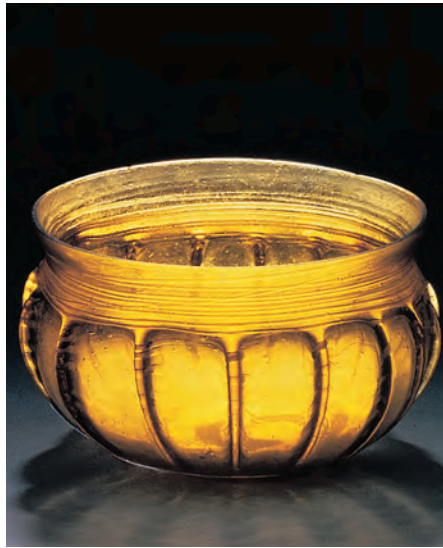
The Organization of Long-Distance Trade

It is impossible to determine the quantity or value of trade that passed over the silk roads in classical times, but it clearly made a deep impression on contemporaries. By the first century C.E., pepper cinnamon, and other spices graced the tables of the