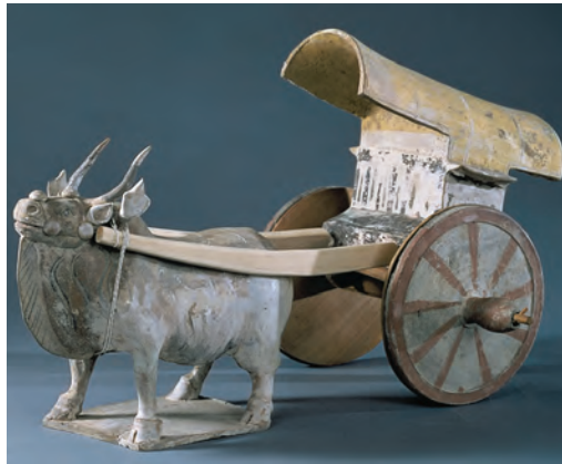
After the collapse of the Han dynasty, China experienced social and economic difficulty. Wealthy classes often traveled in ox carts instead of more expensive, horse-drawn carriages. Archaeologists found this ceramic model of an ox cart in a tomb from the sixth century C.E.

Beneath the disorderly surface of political events, however, several important social and cultural changes were taking place. First, nomadic peoples increasingly adapted to the Chinese environment. They took up agriculture and built permanent settlements. They married Chinese spouses and took Chinese names. They wore the clothes, ate the food, and adopted the customs of China. Some sought a formal Chinese education and became well versed in Chinese philosophy and literature. In short, nomadic peoples became increasingly sinicized, and as the generations passed, distinctions between peoples of nomadic and Chinese ancestry became less and less obvious. Partly because