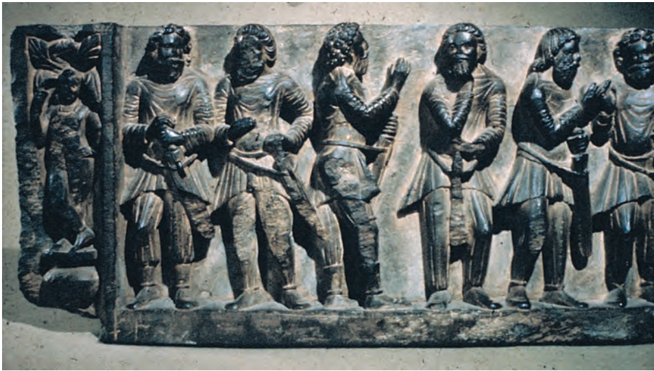
Parthian merchants and other travelers like the soldiers depicted here followed in the footsteps of their Achaemenid and Seleucid predecessors and became regular visitors to northern India. This gray schist carving from Gandhara dates from the second century B.C.E.

Seleucid rulers in Persia and Bactria. Though originally populated by military forces and administrators, these settlements soon attracted Greek merchants and bankers who linked the recently conquered lands to the Mediterranean basin. The Seleucid rulers worked diligently to promote trade. They controlled land routes linking Bactria, which offered access to Indian markets, to Mediterranean ports in Syria and Palestine. Archaeologists have unearthed hundreds of coins, pieces of jewelry, and other physical remains, including Greek-style sculptures and buildings, that testify to the presence of Greek communities in Persia and Bactria during the Hellenistic era.