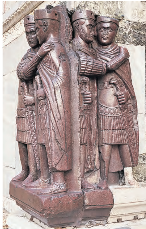
Sculpture of the tetrarchs, or four corulers of the Roman empire, during the late third century C.E.; from left, Galerius, Constantius, Diocletian, and Maximian.

Yet Diocletian’s reforms also encouraged ambition among the four top corulers and their generals, and his retirement from the imperial office in 305 C.E. set off a round of internal struggles and bitter civil war. Already in 306 C.E. Constantine, son of Diocletian’s coruler Constantius, moved to stake his claim as sole emperor. By 313 C.E. he had defeated most of his enemies, although he overcame his last rivals only in 324 C.E. Once he had consolidated his grip on power, Constantine ordered the construction of a new capital city, Constantinople, at a strategic site overlooking the Bosphorus, the strait linking the Black Sea to the Sea of Marmara and beyond to the wealthy eastern Mediterranean. After 330 C.E. Constantinople became the capital of a united Roman empire.