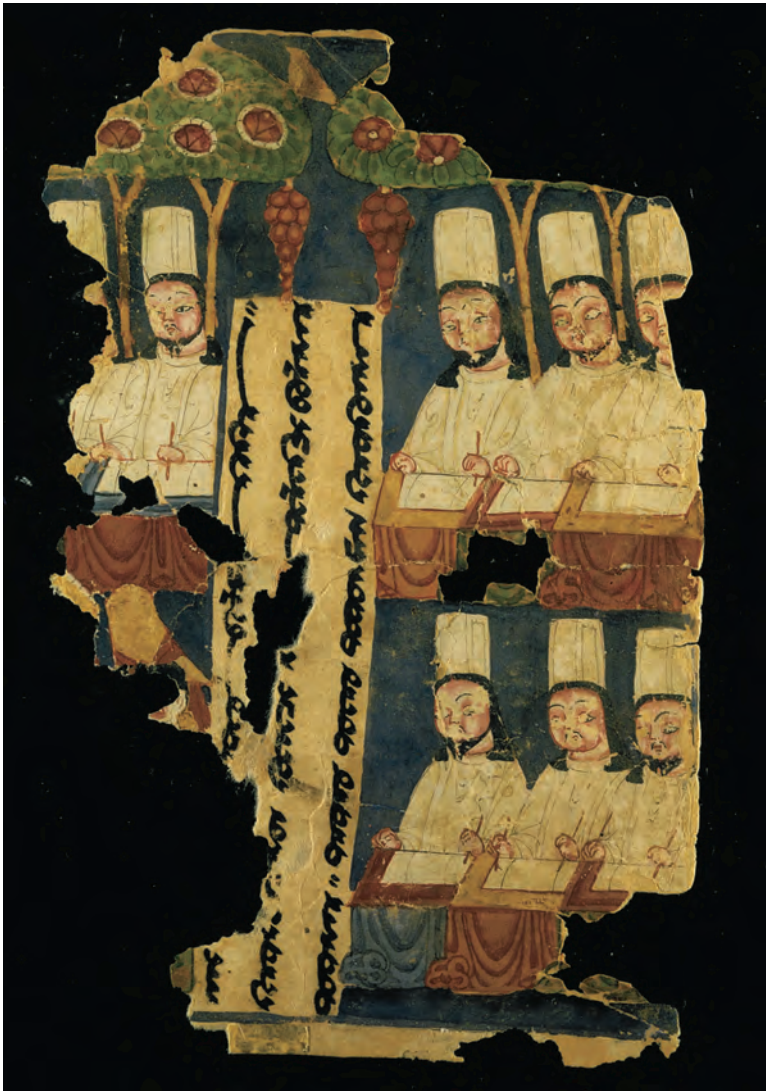
A cave painting from about the seventh century C.E. depicts a group of devout Manichaean faithful, whose austere regimen called for them to dress in plain white garments and keep their hair uncut.

basin. Yet Manichaeism survived in central Asia, where it attracted converts among nomadic Turkish peoples who traded with merchants from China, India, and southwest Asia. Like Buddhism, Hinduism, and Christianity, then, Manichaeism relied on the trade routes of classical times to extend its influence to new lands and peoples.