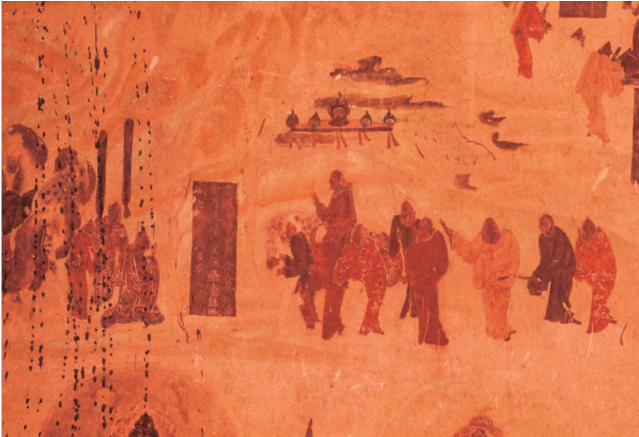
A cave painting from the late seventh century C.E. depicts the Chinese emperor Han Wudi (seated on horse) as he dispatches Zhang Qian (kneeling at left) on his mission to western lands in search of an alliance against the Xiongnu.

The silk roads also included a network of sea-lanes that sustained maritime commerce throughout much of the eastern hemisphere. From Guangzhou in southern China, sea-lanes through the South China Sea linked the east Asian seaboard to the mainland and the islands of southeast Asia. Routes linking southeast Asia with Ceylon (modern Sri Lanka) and India were especially busy during classical times. From India, sea-lanes passed through the Arabian Sea to Persia and Arabia, and through the Persian Gulf and the Red Sea they offered access to land routes and the Mediterranean basin, which already possessed a well-developed network of trade routes.