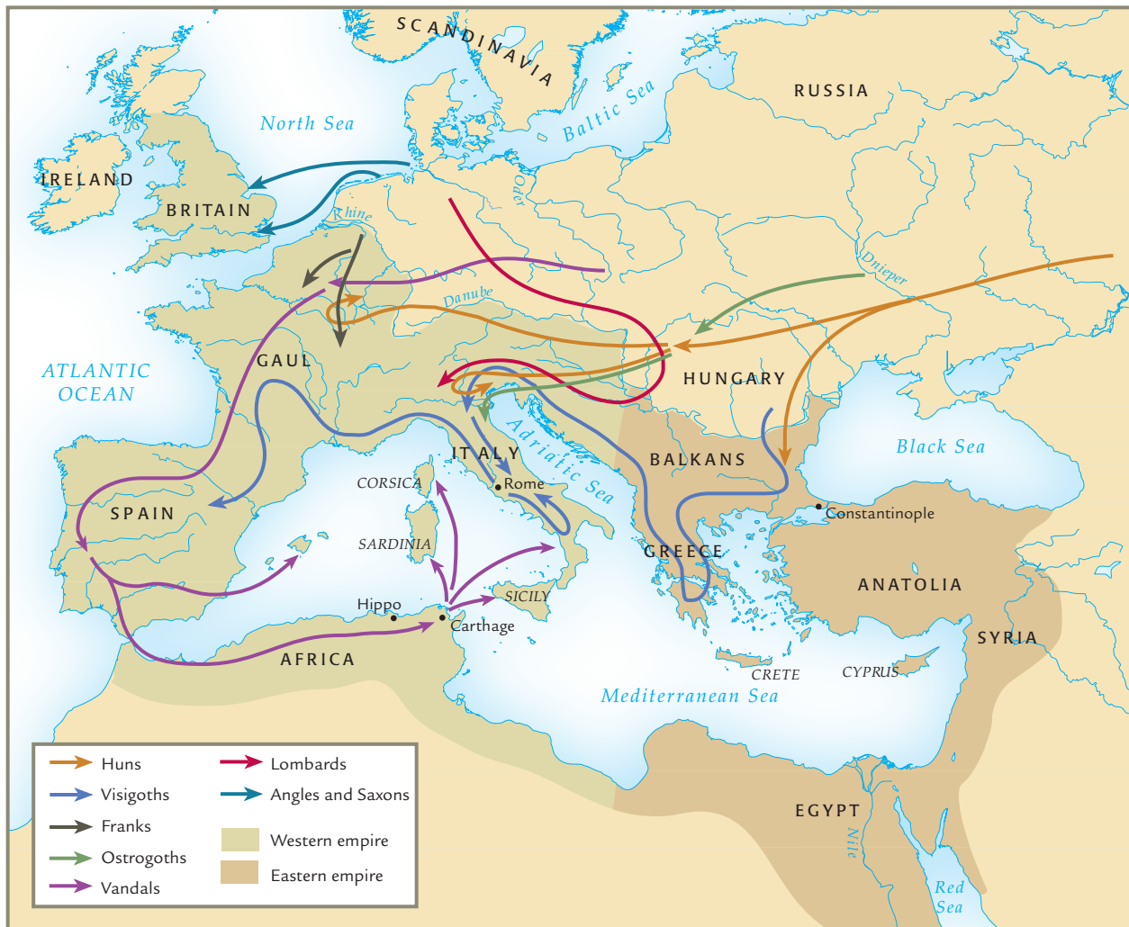
Map 12.4 Germanic invasions and the fall of the western Roman empire, 450–476 C.E. Many different groups invaded the Roman empire following many different routes. Why did the Germanic invasions concentrate on the western Roman empire?

tered little effective resistance and moved around almost at will. They established settlements throughout the western half of the empire—Italy, Gaul, Spain, Britain, and north Africa—where populations were less dense than in the eastern Mediterranean. Under the command of Alaric, the Visigoths even stormed and sacked Rome in 410 C.E. By the middle of the fifth century, the western part of the Roman empire was in shambles. In 476 C.E. imperial authority came to an ignominious end when the Germanic general Odovacer deposed Romulus Augustulus, the last of the Roman emperors in the western half of the empire.