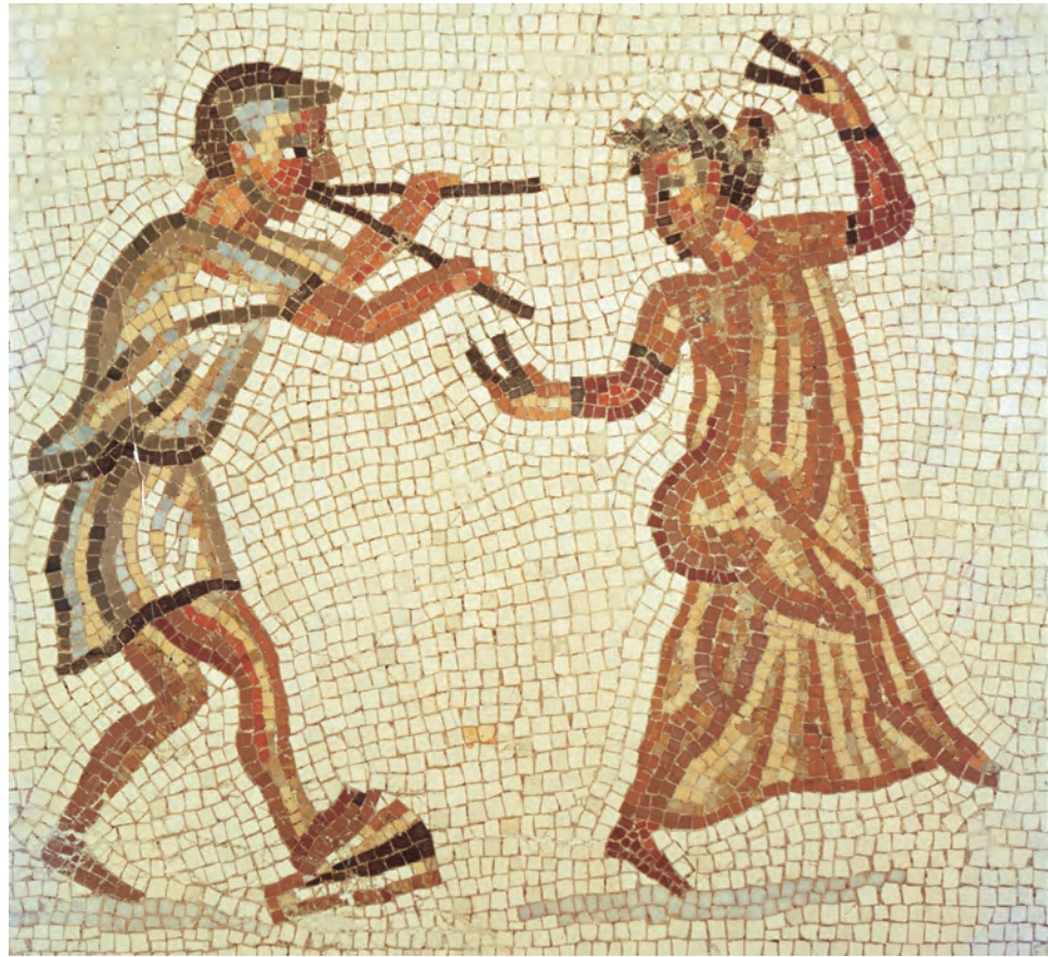
A mosaic of the second century C.E. depicts a musician playing flutes and a dancer wearing a thin and revealing silk garment.

wealthy classes in the Roman empire, where silk garments had become items of high fashion. Indeed, silk was in such demand that Roman merchants often stretched their supplies by unraveling the densely woven fabrics that came from China and then reweaving them into larger numbers of sheer garments that were sometimes so light as to be transparent. Some Romans fretted that see-through silk attire would lead to moral decay, and others worried that hefty expenditures for luxury items would ruin the imperial economy. In both cases their anxieties testified to the powerful attraction of imported silks and spices for Roman consumers.