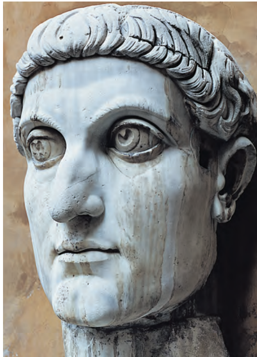
Only the colossal head of Constantine survives from a statue that originally stood about 14 meters (46 feet) tall.

Early Christians might well have continued to express their understandings of their faith in individual ways. During the third and fourth centuries, however, as the Roman empire experienced political turmoil and underwent administrative changes, some church leaders sought doctrinal stability and worked to define essential tenets that all Christians must accept. As Christians became more prominent in the Roman empire, state authorities also promoted efforts to standardize teachings. Emperor Constantine himself pushed for a clear statement of Christian doctrine that he hoped would create a foundation for cultural unity in the Roman empire.