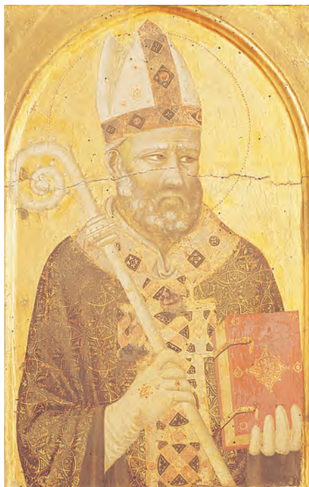
Portrait of St. Augustine holding a copy of his most famous work, The City of God , which sought to explain the meaning of history and the world from a Christian point of view.