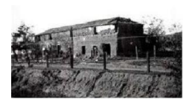
RANCHO SANTIAGO DE SANTA ANA