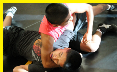
What's going on with Wrestling? Go to Page 8