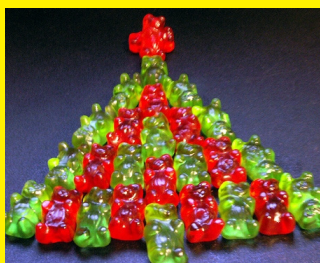
Gummy Bear Go to Page 3