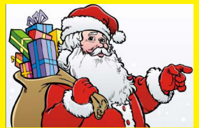
To get in the Christmas spirit Go to Pages 6-7