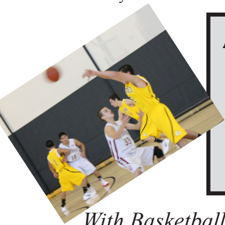
With Basketball Season starting, here are a few photos. Check them out!