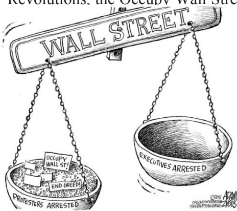
(Illustration courtesy of The Orange County Register)