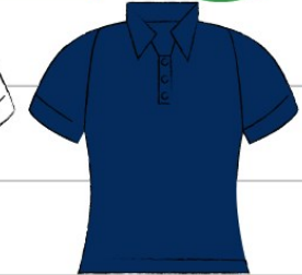
Navy Blue Azul marino