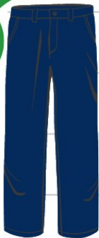
Navy Blue Azul marino