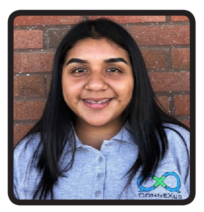
February 24, 2001 Accounting Associate