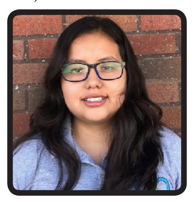
February 21, 1998 Human Resource Associate