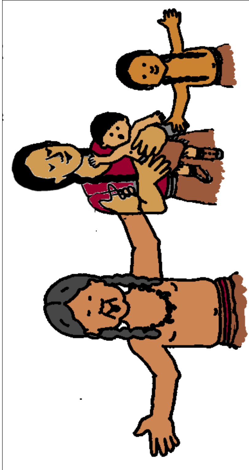
Place Wampanoag on “America”