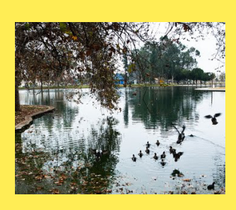
Night in Centennial