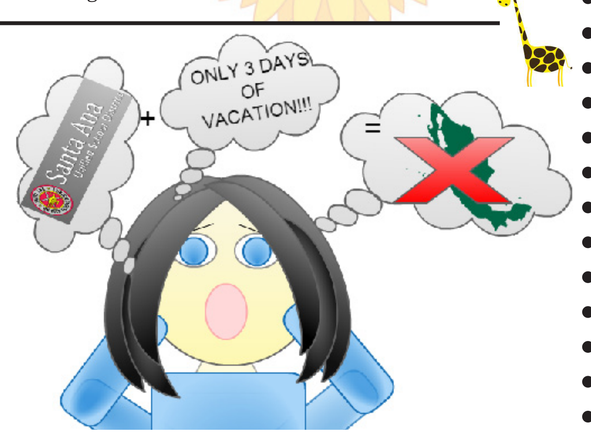
(Infographic Courtesy Hugo Salgado)

The students who have already heard the news are not as optimistic as the teachers. There