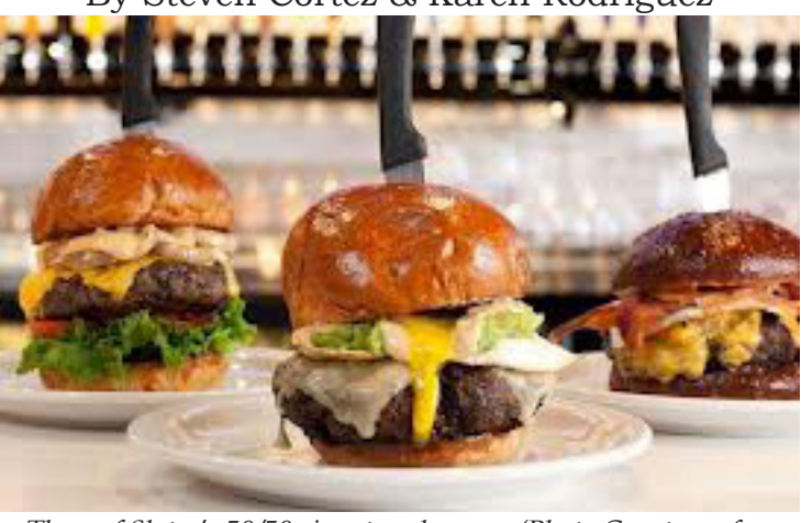
Three of Slater's 50/50 signature burgers

Slater's has also managed to adopt a savvy way of reserving a table by contacting you through text message instead of yelling out random names. We hadn't even entered through the front doors and we were already impressed by the hospitality which included the complimentary valet parking and warm greeting by