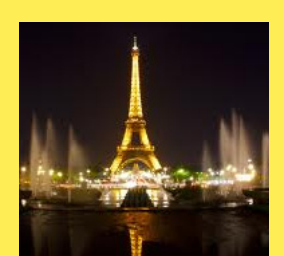
One lucky GFHS student could win a free trip to Europe! Check Pg. 9 for details