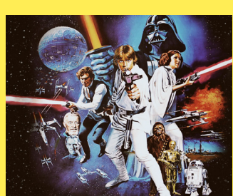
Death Star Blowout