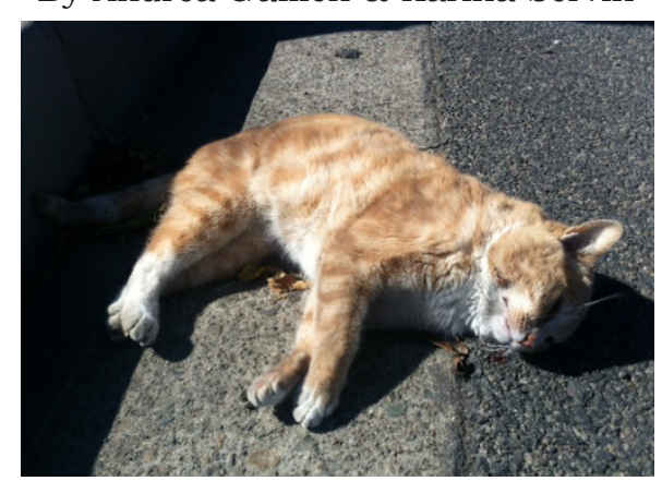
The Godinez Tabby Cat during her final moments. Jaguars are suspected of poisoning the cat.